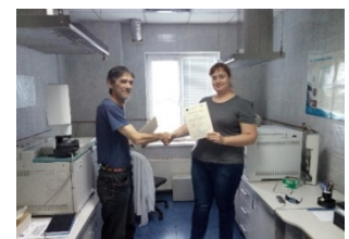
Laboratory training for the Environmental Agency of Moldova.