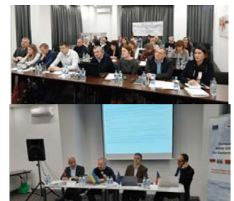
Regional Workshop on economic analysis related to River Basin Management Plan development for experts from Belarus, Republic of Moldova, and Ukraine.