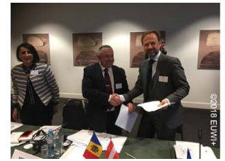
Moldova is ready to launch the modernization of its laboratories